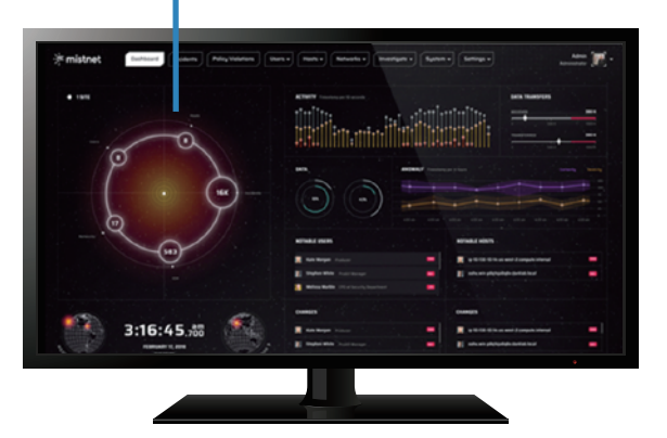
Figure 1: Accurate threat detection with user and host visibility

Real-time dashboard shows detected attack indicators, compliance violations, hosts, users, and incidents.